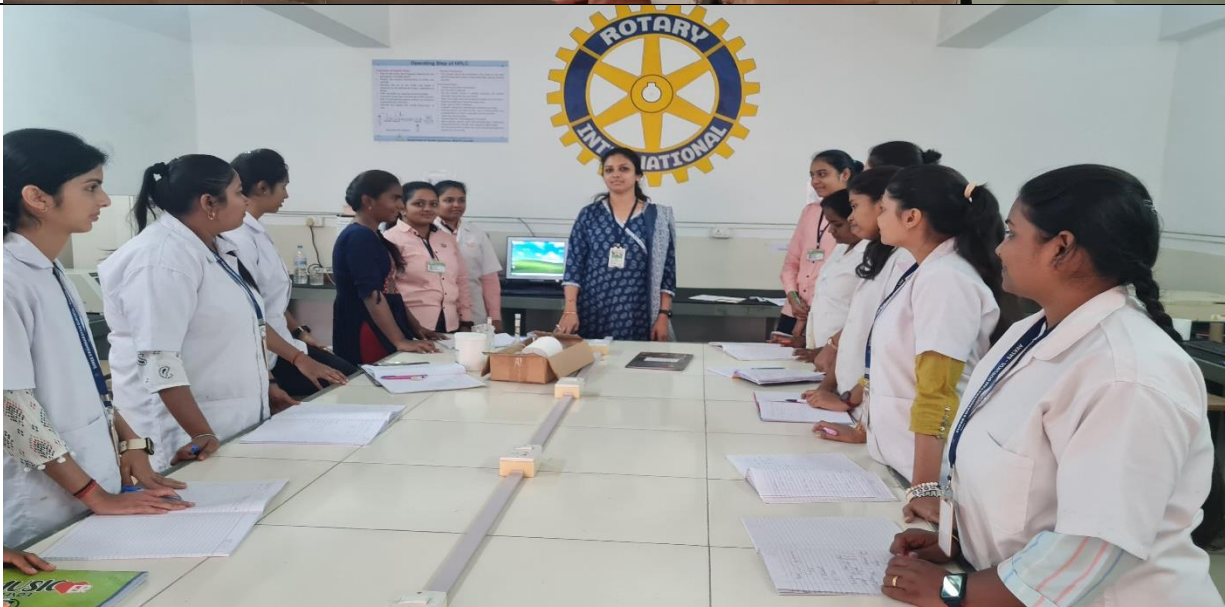
Shree Naranjibhai Lalbhai Patel College of Pharmacy, Vidyabharti Trust, UmraKh, Bardoli.