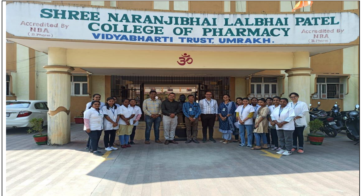
Shree Naranjibhai Lalbhai Patel College of Pharmacy, Vidyabharti Trust, UmraKh, Bardoli.